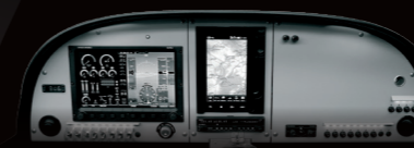
SportCruiser SVAP Light

1x SkyView SV-D1000T MFD screen with back-up battery SV-BAT-320 Air data, attitude, heading reference system. SV-ADAHRS-200 1x Skyview SV-GPS-250 built-in GPS SV-MAP-270 navigation software SkyView Internal AutoPilot SkyView Internal Transponder, SV-XPNDR-261 (S-Mode Class 1) SV-EMS-220 Engine Monitoring Module OAT Probe Pitch Trim Indicator on MFD Aileron Trim Indicator on MFD ADS-B receiver SV-ADSB-470 VHF - NAV/COM Intercom ELT Stall Warning Ballistic Recovery System (*) LiPo Battery (**)